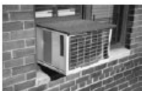
$19.99 per Unit

Stopdrop is a 24 inch square piece of foam bonded to a magnetic sheet that adheres to the top of a window-mounted air conditioner. No more towels, cardboard or carpet remnants tied around the air conditioner! It cuts easily to fit your air conditioner.